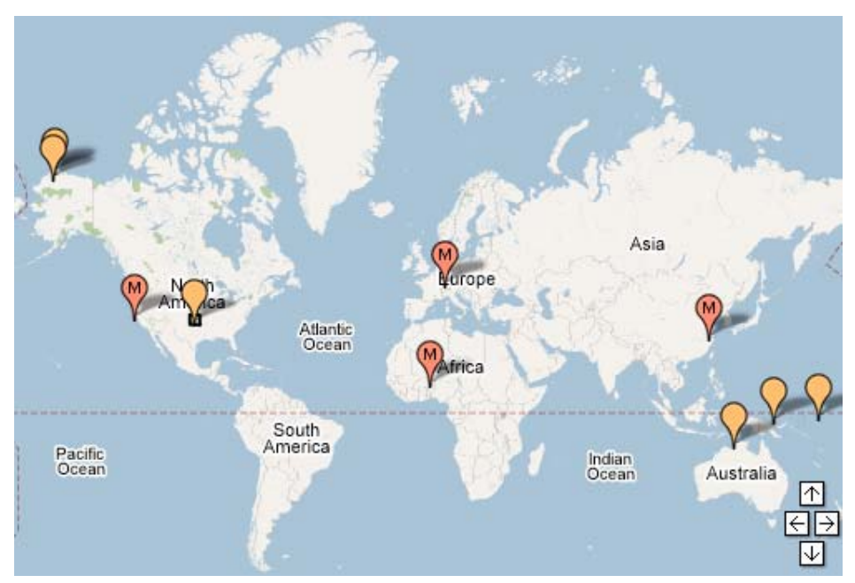
Figure 2 ARM Sites

ARM is the DOE's largest global change research program. It was created to help resolve scientific questions related to global climate change, with a specific focus on the crucial role of clouds and their influence on radiative feedback processes in the atmosphere. ARM's primary goal is to improve the treatment of cloud and radiation physics in global climate models so they can more accurately simulate and predict future climate conditions.